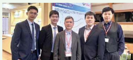
PharmaEssentia supported Taiwanese physicians in attending exchanges at the Japanese Society of Hematology (JSH) Annual Meeting

2024 Japanese Society of Hematology (JSH) Annual Meeting: Supported 2 Taiwanese physicians in presenting research progress on Ropgeinterferon