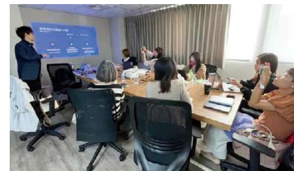
Hosted one-day training course for MPN case managers