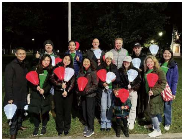
US subsidiary participated in Leukemia & Lymphoma Society Light the Night event

PharmaEssentia's US subsidiary continued to sponsor MPN associations and activities in 2024, including MPN Advocacy & Education International, MPN Research Foundation, National Organization for Rare Disorders, Cancer Research & Treatment Fund, Leukemia & Lymphoma Society (New England Chapter). In 2024, our cumulative sponsorship amount reached US$236,500. Additionally, our US subsidiary participated in leukemia community activities