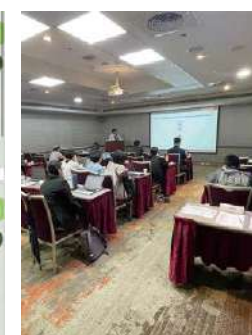
Jointly hosted seminar for medical professionals in 2024 with Taiwan Society of Blood and Marrow Transplantation: Molecular Testing Innovations and Rare Hemato-Oncological Disorders

PharmaEssentia collects stakeholder feedback and perspectives through seminars and exchange activities, including Taiwanese physician clinical treatment goals for PV, improved understanding of PV in patients and their families, and discussions of how to enhance muscle strength and reduce sudden bleeding risks through rehabilitation. PharmaEssentia will continue to provide professional health education and drug information to patients, patient families, and HCPs to improve patient care and quality.