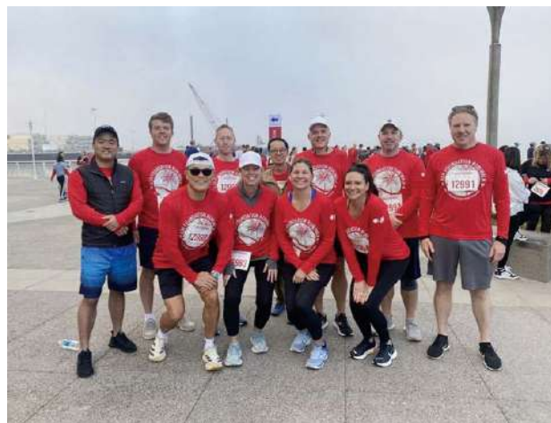
US subsidiary participated in ASH Foundation charity run/walk event

PharmaEssentia's US subsidiary continued to sponsor MPN associations and activities in 2024, including MPN Advocacy & Education International, MPN Research Foundation, National Organization for Rare Disorders, Cancer Research & Treatment Fund, Leukemia & Lymphoma Society (New England Chapter). In 2024, our cumulative sponsorship amount reached US$236,500. Additionally, our US subsidiary participated in leukemia community activities