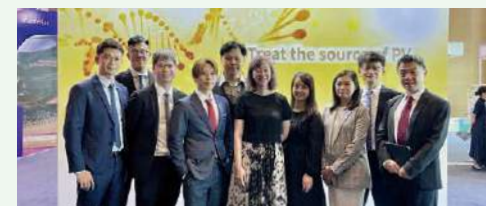
PharmaEssentia sponsored 2024 Joint Annual Congress of Taiwan Society of Blood and Marrow Transplantation (TBMT) and Hematology Society of Taiwan (HST)

Hosted health education activities in collaboration with the Hematology Society of Taiwan, Taiwan Society of Blood and Marrow Transplantation, and pharmacist associations to enhance physician knowledge of new information in the MPN domain and treatment efficacy of long-acting interferon alfa-2b